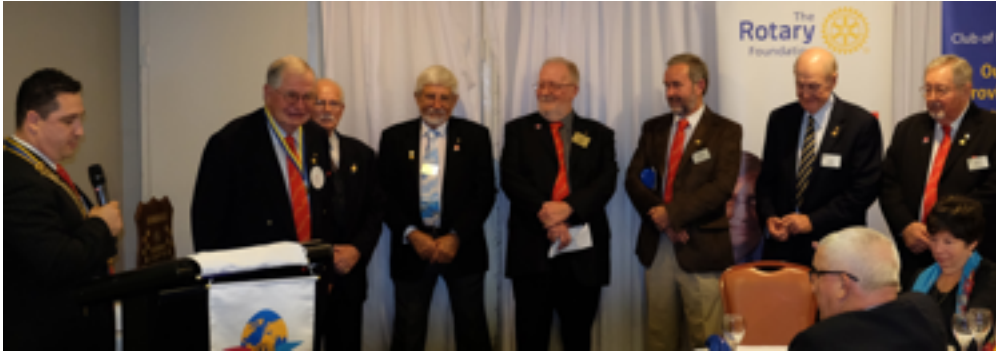
Photo to left, is one of present board members installation now responsible in deliberations as mentioned, elsewhere.